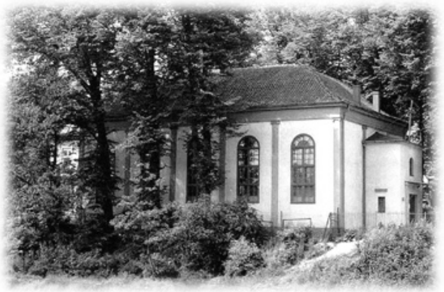
The former United Flemish and Frisian Mennonite Church in Gdansk (formerly Danzig).

Sixteenth-century Poland fervently desired growth. Territorially, it was the largest country in Europe, including present-day Poland, Lithuania, Belarus and the Ukraine. Economically, it was behind western Europe so it was open for business expansion. In the 1500s, an expanding economy