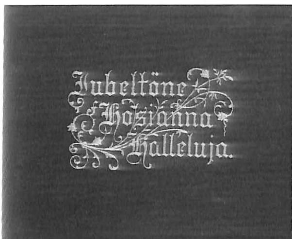
Dreiband , early hymnal in the PDC

Rauschenbusch and musician Ira D. Sankey. This hymn book was primarily a collection of German translations of American gospel songs. It had been published for use by all German speaking Christians in America. Its use in MB churches was so pervasive that it almost was thought of as a denominational book. In many churches it replaced the older Dreiband . This was a unique book made up of three