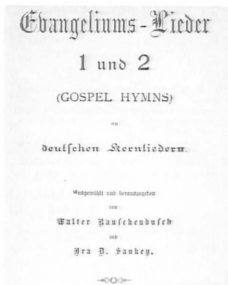
Evangeliums Leader widely used hymnal in the PDC